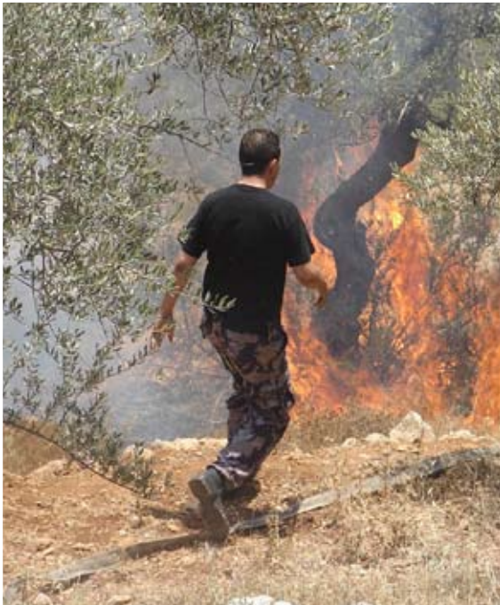
RHR helped combat fires and other violent activities perpetrated against Palestinians and their property by Israeli settlers' "Operation Price Tag"

RHR facilitated fact-finding field trips to the West Bank, showing the pattern of continuous land-grabs despite the temporary building freeze, Israel's methodological domination of water resources, and settler encroachment onto Palestinian farmlands through tree-uprooting, bullying, and the use of land confiscations through archeological claims filed with the Israeli Antiquities Authority.