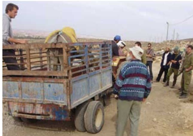
IDF and Settlers prevent Bir al-Id returnees from using access road

Most recently, we began fighting orders to demolish animal pens and tents donated by humanitarian organizations that help house the villagers in addition to the caves. RHR obtained a temporary freeze on the demolitions while we prepare a revised local zoning plan for the residents in our last, best-hope effort to prevent what amounts to a second, and likely final, eviction of the villagers.