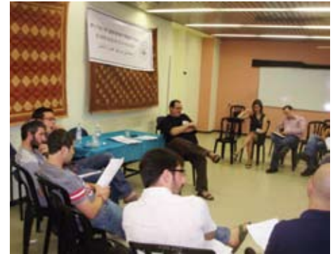
Alumni from seven years of RHR's Human Rights Yeshiva program at Hebrew University meet and reconnect with study and activism.