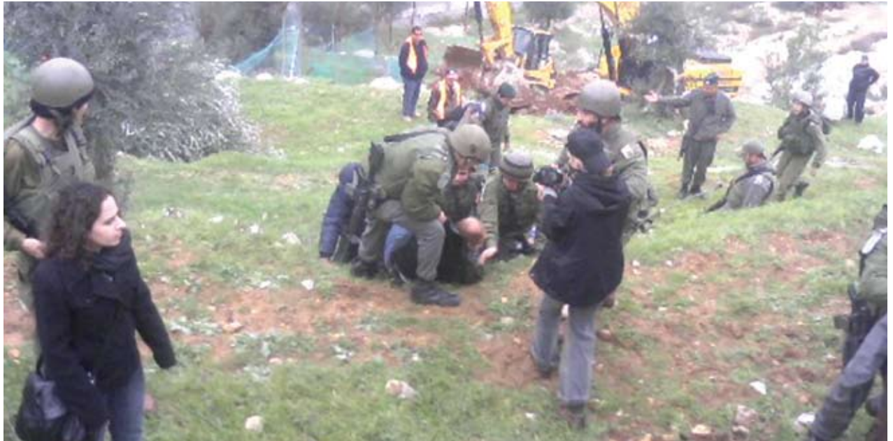
RHR volunteers and other activists protest the uprooting of olive trees to make way for the Separation Barrier in the fields of Beit Jallah.