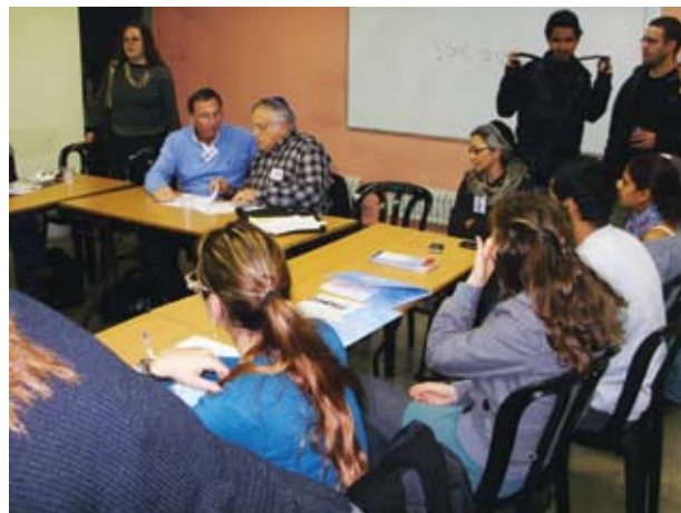
Students study with RHR Rabbis at the Human Rights Yeshiva, held at the Hebrew University in Jerusalem.