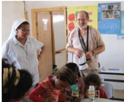
Activities at this years' Jahalin Summer Camp were held at the "Tire School" to demonstrate that the school year did not technically end, thus trying to prevent implementation of the demolition order issued for the structure