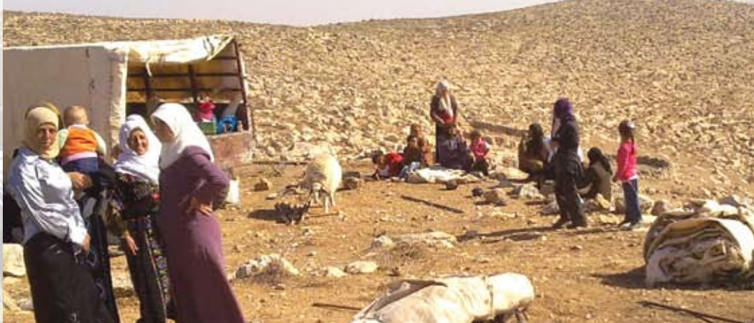
Women and children unpack their belongings as they return to their homes in Bir Al -'Id after being expelled ten years ago

Since 2009, the Abu Qabaita family has been required to apply for permits from the Israeli Civil Administration in order to leave or return to their homes. Two-thirds of the family (fifty adults and children) were denied permits and suffered difficulties at nearby checkpoints. In September 2009 RHR petitioned the Supreme Court, arguing that the denial of permanent residence status gravely violates their rights. As a result, the Civil Administration granted thirty appellants of the Abu Qabaita family permits enabling them to continue living in their homes on their private land.